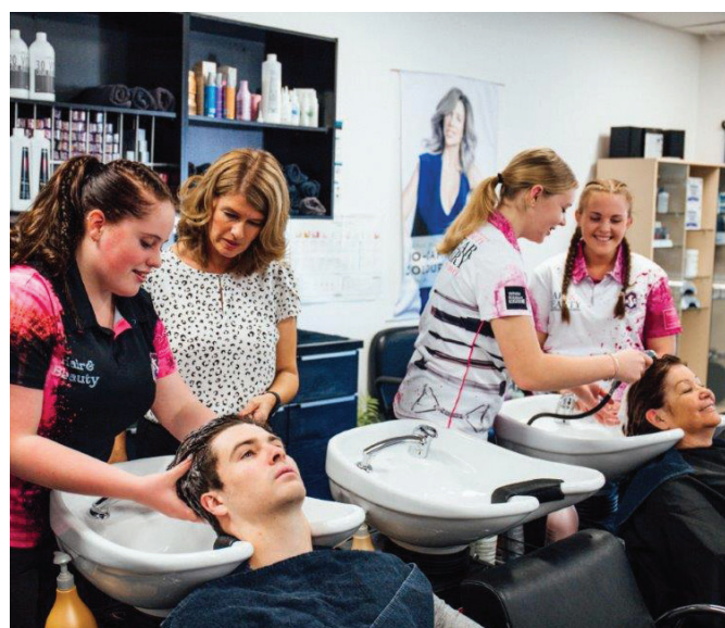
Students practising their skills at the school's commercial salon

Most students at the school graduate with a certificate qualification. The school has cemented itself as an institution in the local community; its work, reputation and value are widely recognised. The school is a place people come back to, either by re-enrolling to complete their education or giving back to the next generation as teachers. As the majority of students will likely live and work within a 40 kilometre radius of the school, producing job-ready graduates makes a difference to the entire community.